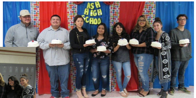
A few of our recent graduates, January 2018